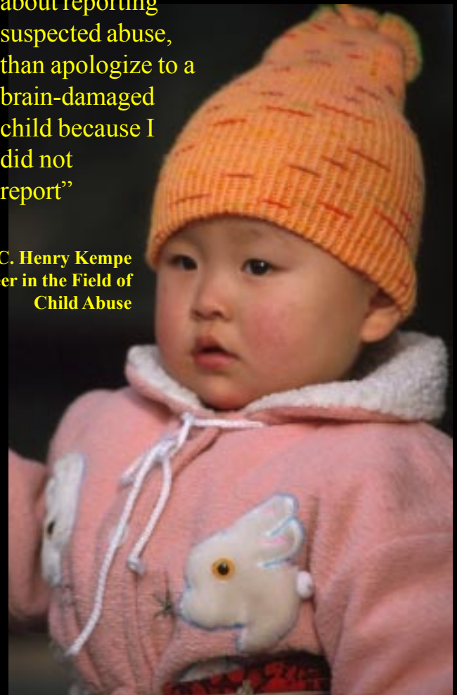
Dr. C. Henry Kempe Pioneer in the Field of Child Abuse

“I would rather apologize to a parent because I made a mistake about reporting suspected abuse, than apologize to a brain-damaged child because I did not report”